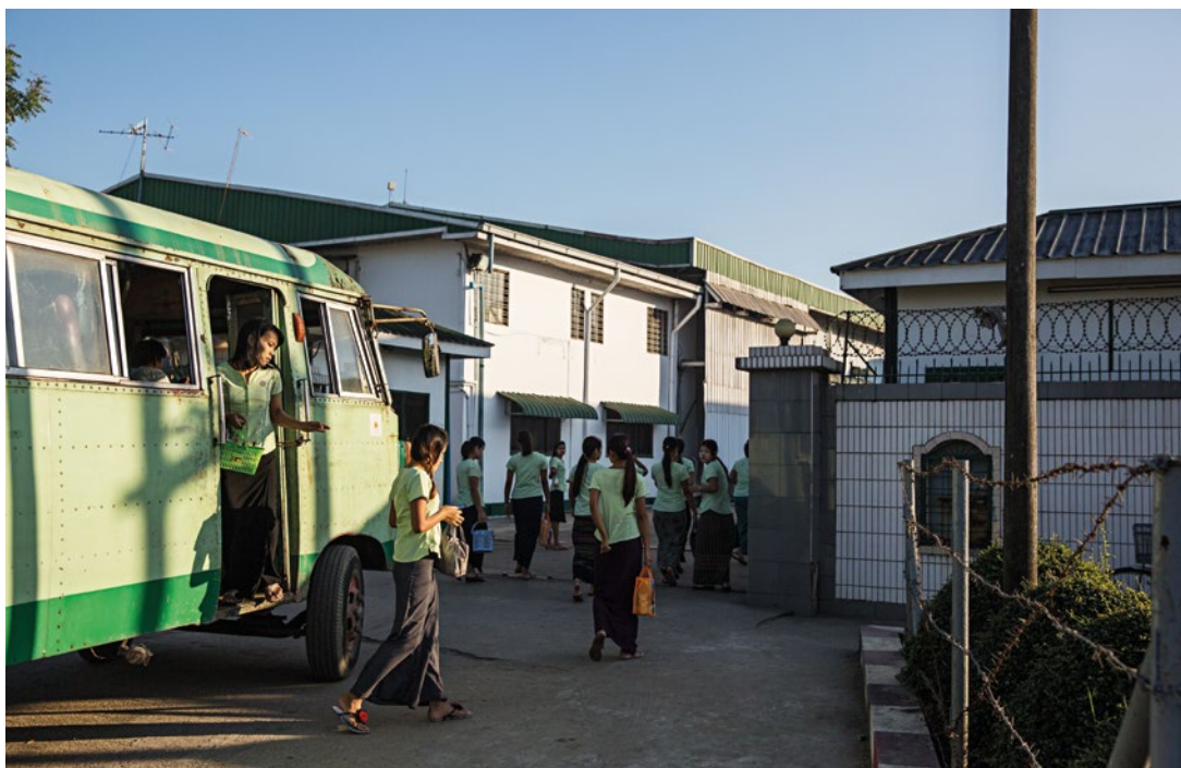
A shuttle bus drops off workers..