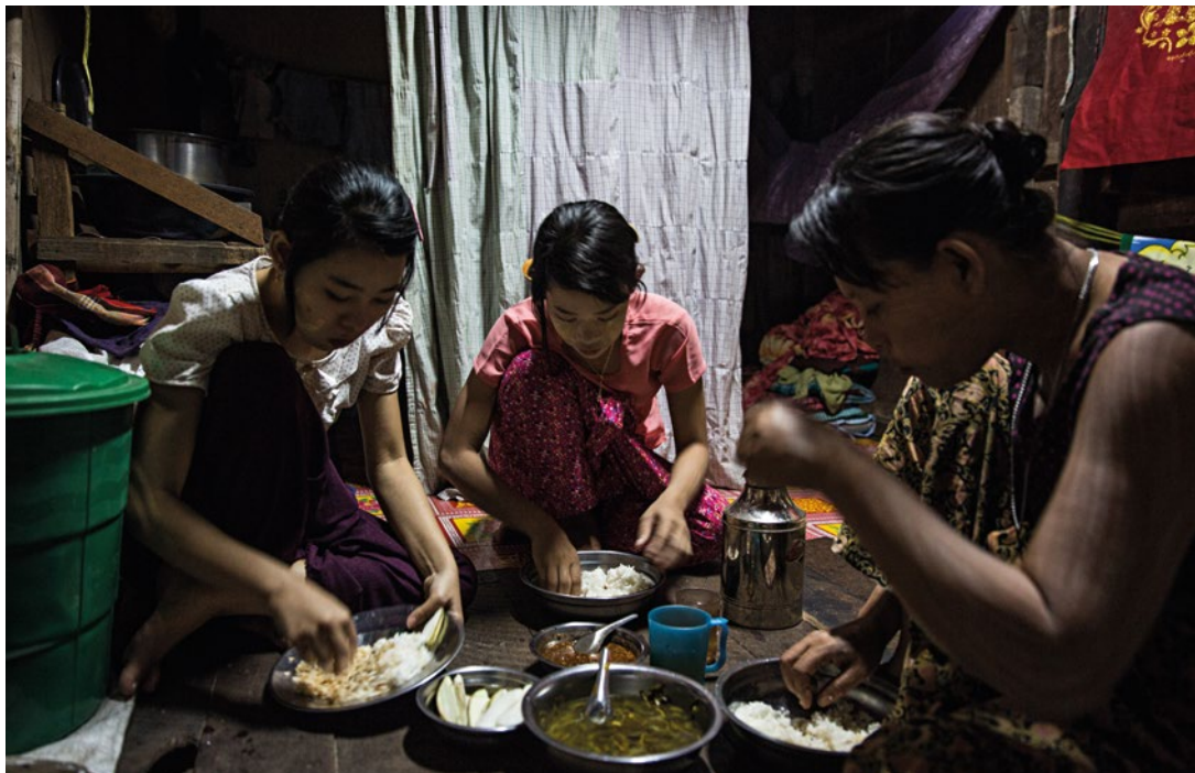
Garment factory workers eat dinner in their small home.